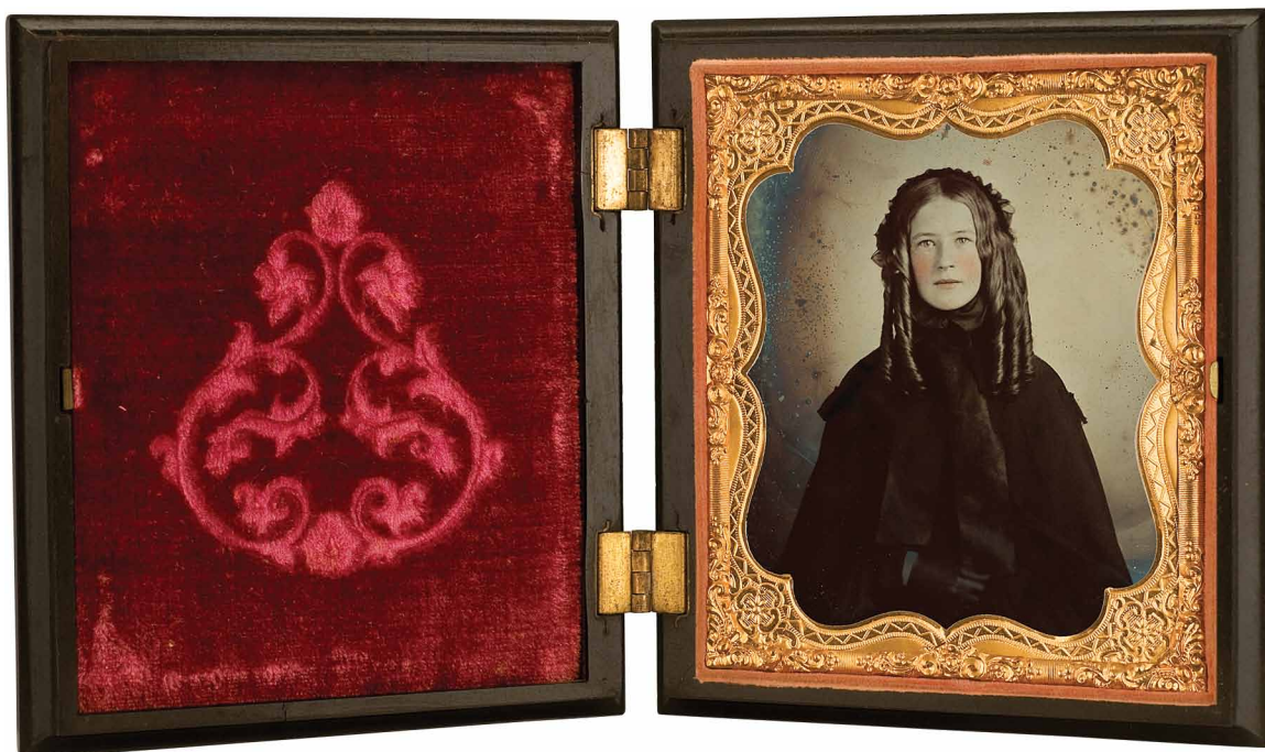
Figure i-1. A beautiful c. 1860 ambrotype in a thermoplastic case.

The majority of daguerreotypes and ambrotypes were placed in cases, though a few were put into wall or stand-up frames. If you own a loose daguerreotype or